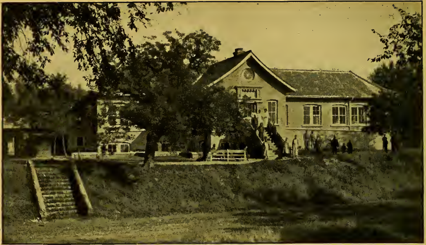
TUNGHSIEN HOSPITAL, CHINA